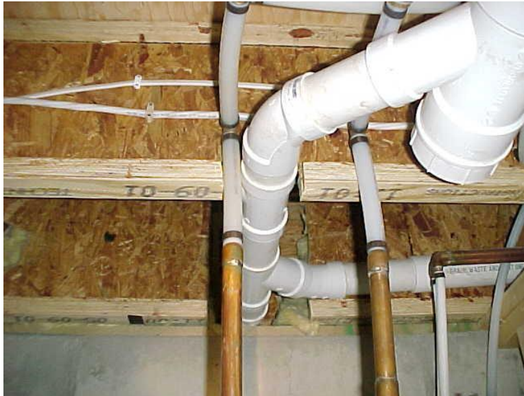
Figure 1. The I-joist depicted has no recognized load capacity because the bottom flange has been cut. The practice of cutting I-joist may stem from the fact that a 2x10, for example, may be notched per the code up to 1.54-inches (or D/6 ) in the outer thirds of the span (IRC, Figure R502.8). Since a typical depth of I-joist flanges is 1-3/8 inches, using the maximum permitted “notching rule” for a solid-sawn 2x10 on an I-joist destroys the strength and stiffness capabilities of the joist.

It may be obvious that the cut bottom flanges are detrimental to the strength and stiffness of the joist shown in Figure 1, but the impact of the cut joist on the ability of subfloor sheathing to support a brittle floor surface may not be obvious or well understood. The cut joist, which is approximately 17" from the concrete wall, causes the effective spacing of the joists supporting the subfloor to be 32", well in excess of the 16" permitted joist spacing for method F144-07. Note that a second joist flange in Figure 1 is also cut. However, because it had a slight amount of bearing on a sill plate, we did not include in our analysis the possible impact of the cut flange on subfloor span.