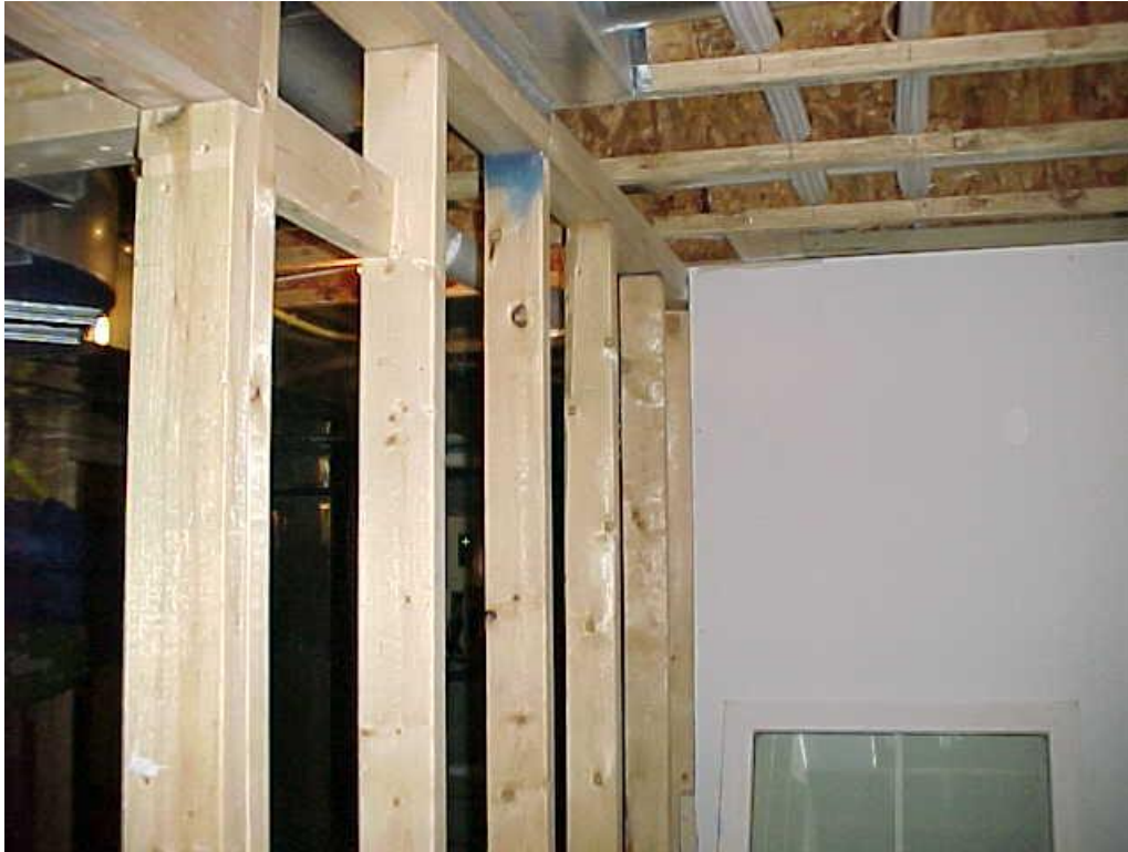
Figure 2. Load-bearing wall without sheathing used to support the I-joist framing.

To the untrained eye, the stud framing in Figure 2 is attractive and may not trigger any suspicion as causing tile and grout problems on the floor above. Apparently, in this